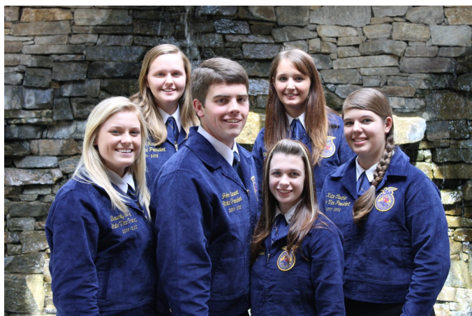
2011-2012 NC FFA State Officer Team

Congratulations to our new and reactivated North Carolina FFA Alumni Affiliates! NC FFA Alumni is excited to welcome these new affiliates and is looking forward to great things to come.