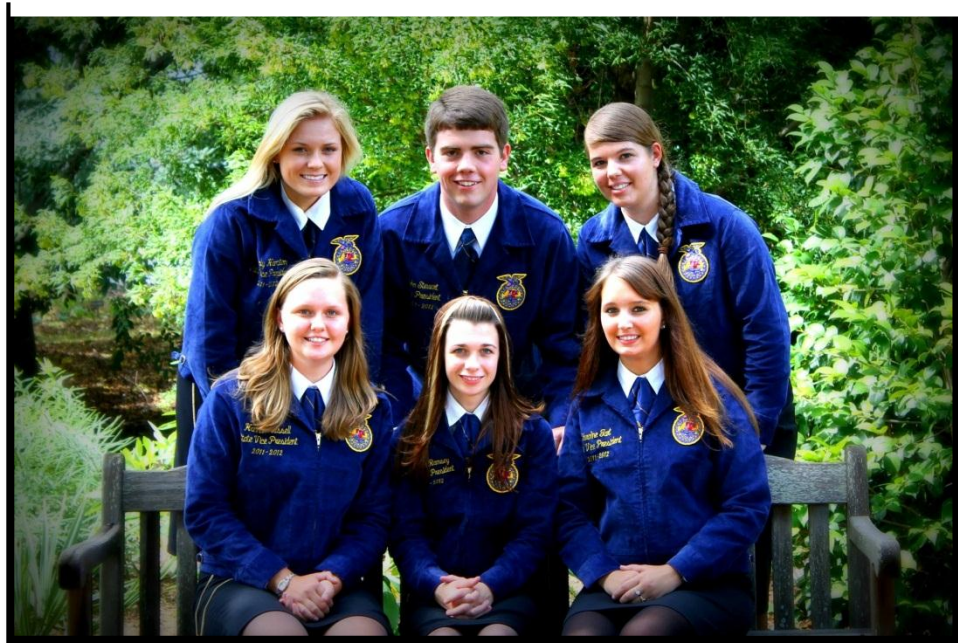
2011-2012 State FFA Officer Team