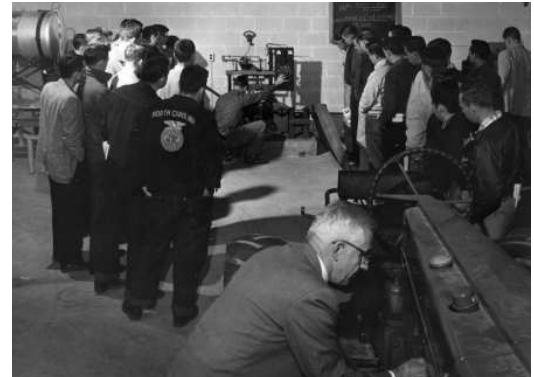
An early agriculture classroom