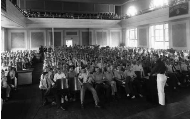
First State FFA Convention held at NC State