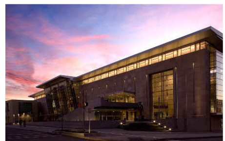
Raleigh Convention Center from Salisbury Street